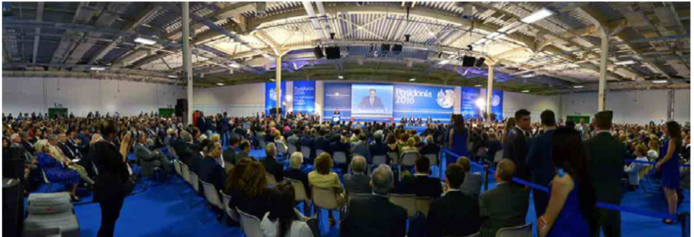
PHOTOS FROM POSIDONIA 2016

Posidonia 2016 has received overwhelming praise from exhibitors and visitors who unanimously agree that this year's edition of the world's most prestigious maritime event has also been the most distinguished in the show's five-decade long history.